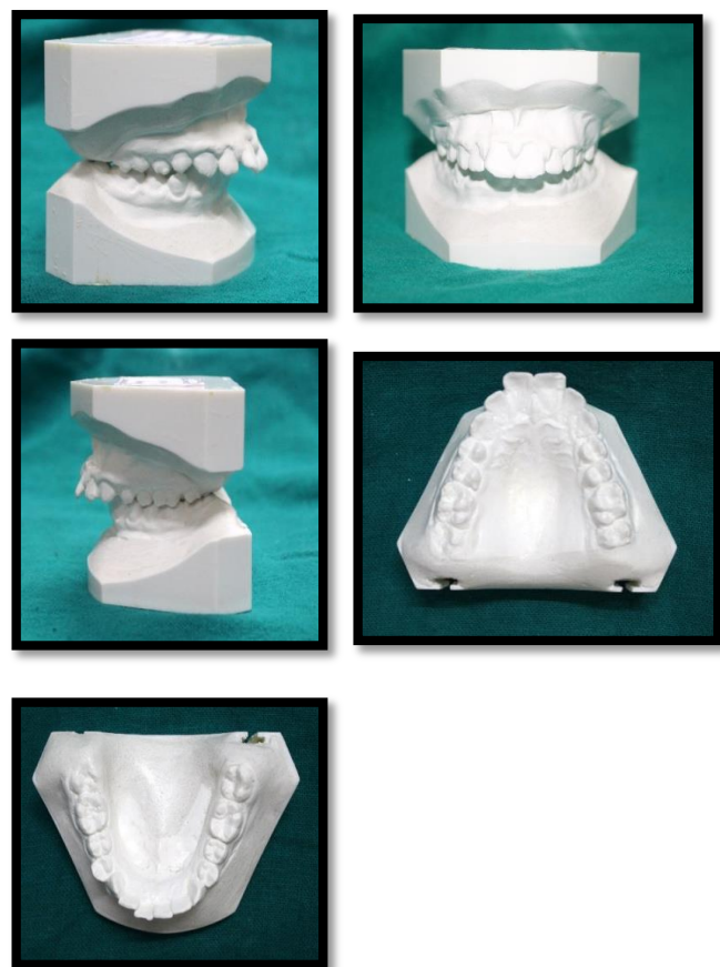
Fig 2: Pretreatment intra-oral study models.