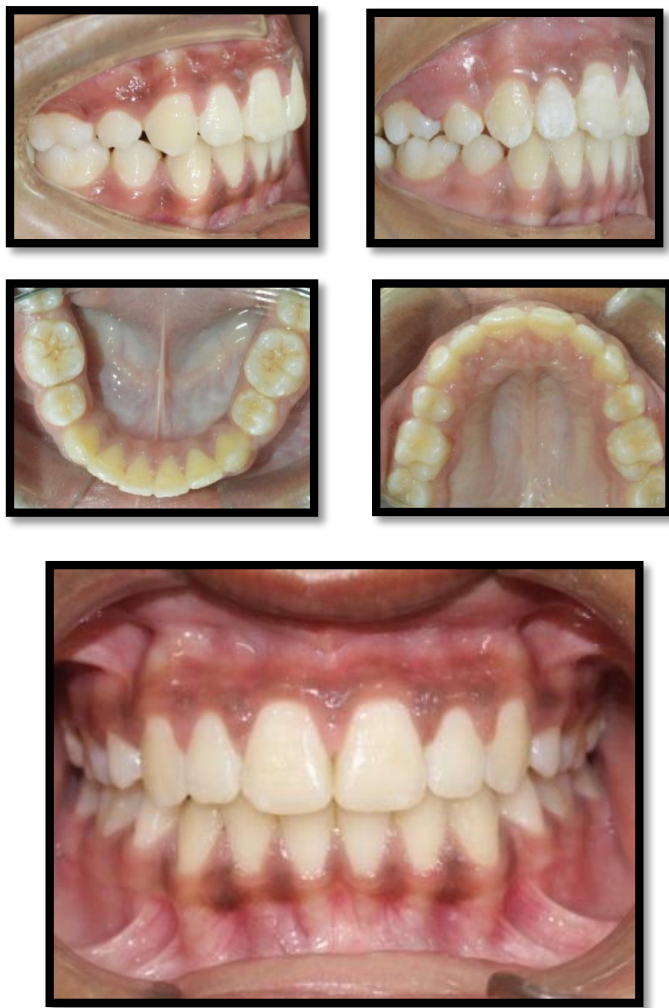
Fig 8- 1 year follow up extra and intra oral records of the patient.