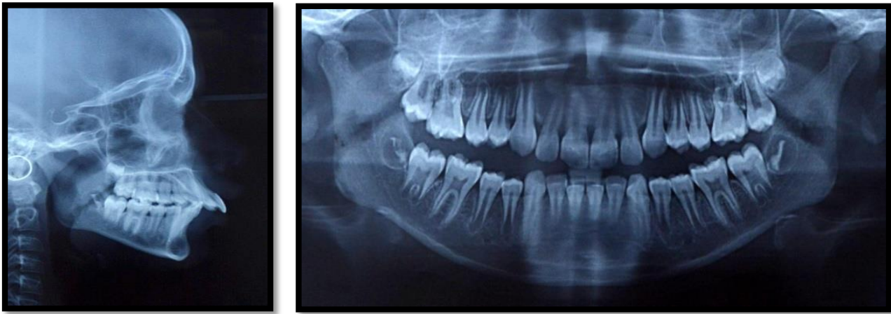
Fig 3: (a) pretreatment lateral cephalogram and (b) OPG.