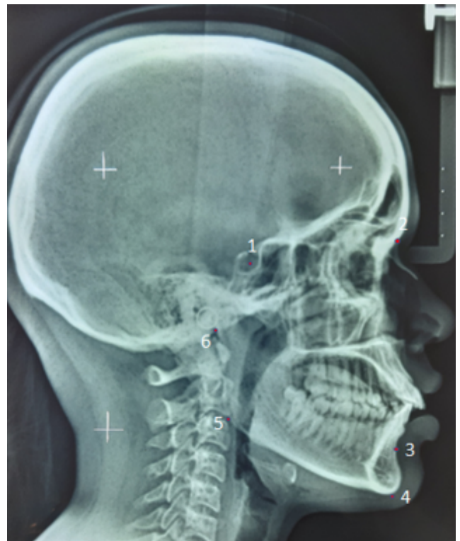
Fig. 1: Cephalometric landmarks used (1- Sella, 2- Nasion, 3- Point B, 4- Menton, 5- Gonion, 6-Articulare)