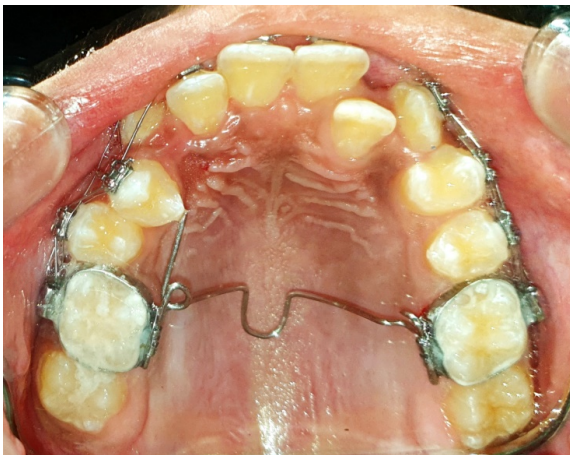
Figure 2: Modified transpalatal arch inserted with first maxillary wire.