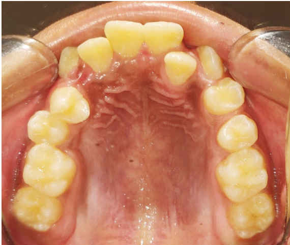
Figure 1: Pre treatment