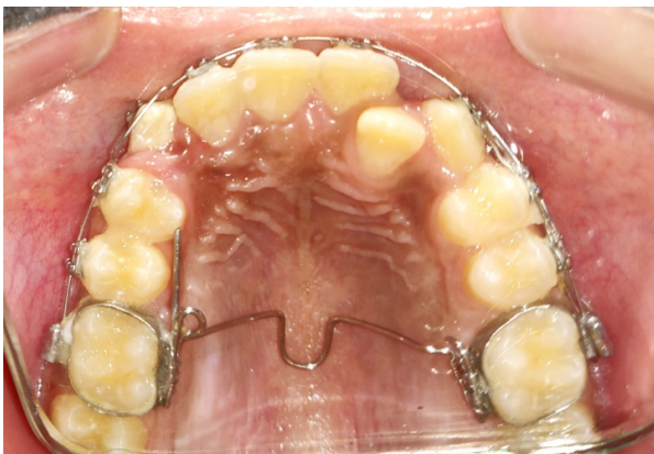
Figure 3: Progress after 3 weeks