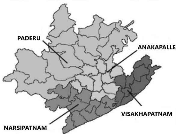
Figure 1: The Revenue Divisions of Visakhapatnam District