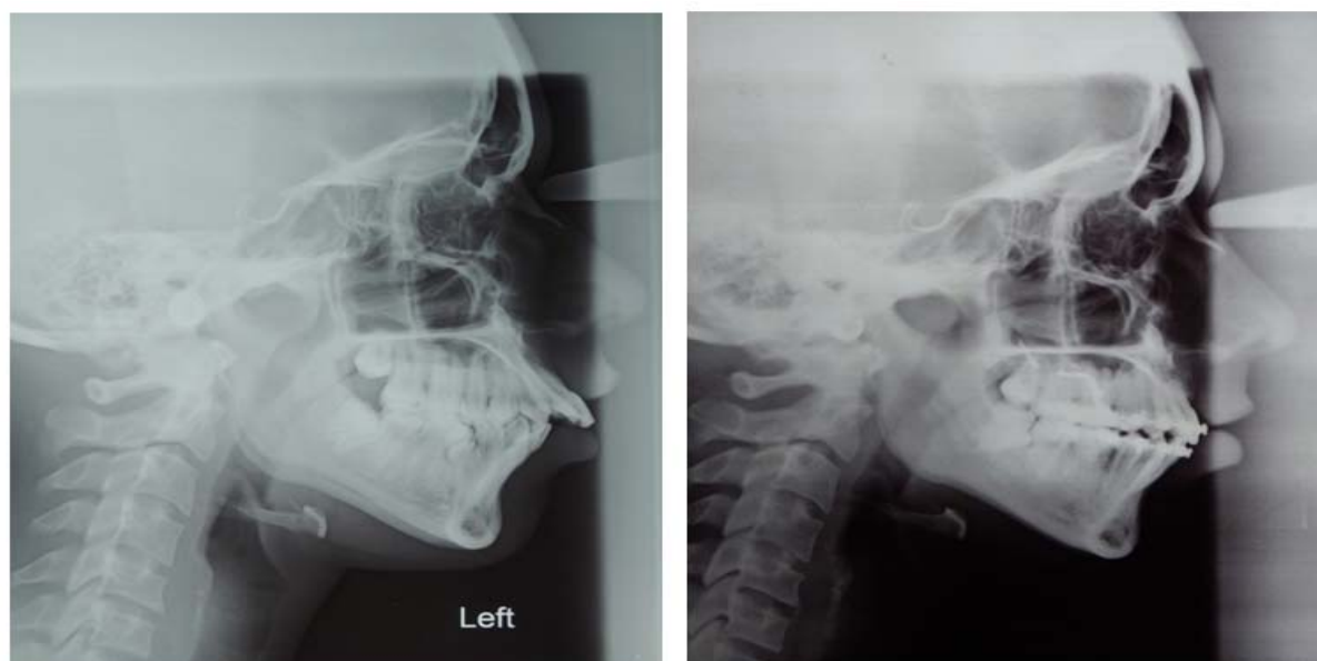
Fig. 8. Pre and post treatment lateral cephalograms.