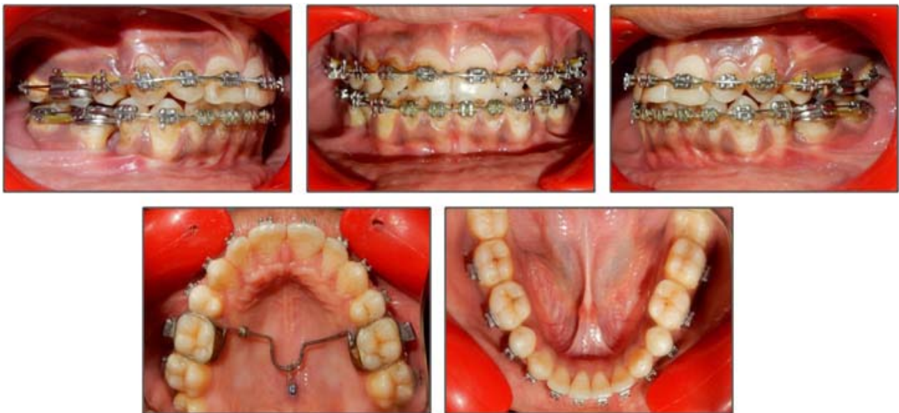
Fig. 4- Treatment progress intraoral photographs

U1-NF=Upper anterior dentoalveolar height; L1-MP= Lower anterior dentoalveolar height; U6-NF= Upper posterior dentoalveolar height; L6-MP= Lower posterior dentoalveolar height.