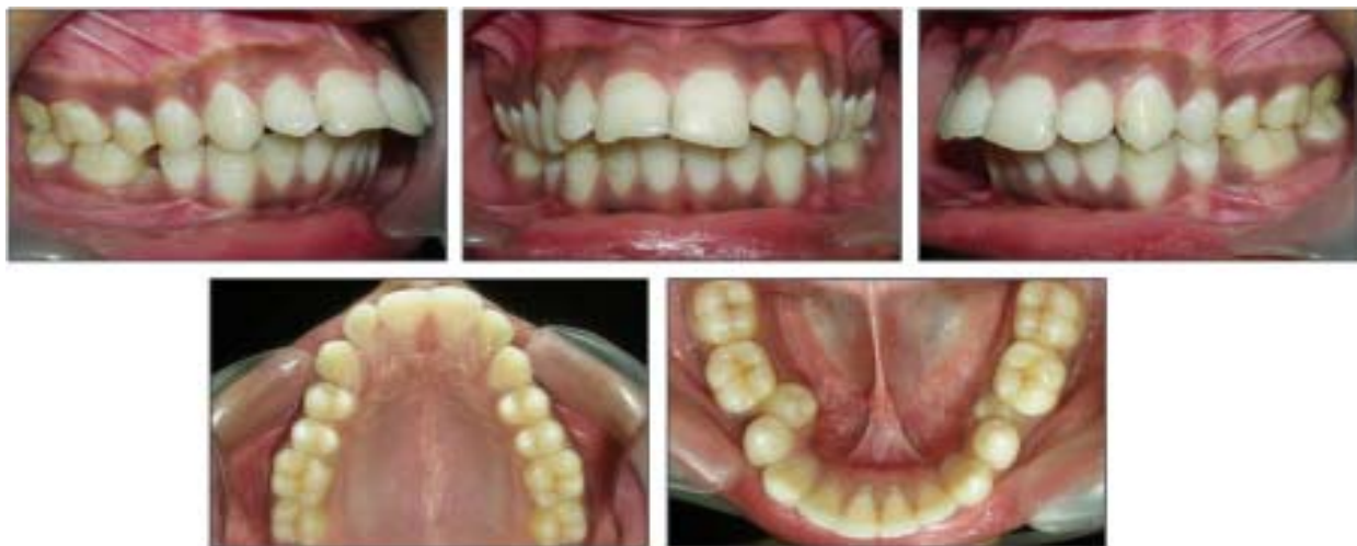
Fig 2. Pre-treatment intraoral photographs