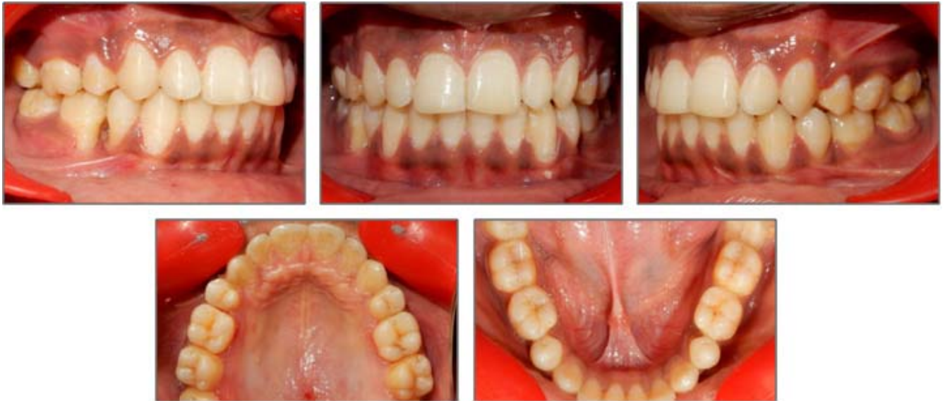
Fig 6. Post-treatment intraoral photographs