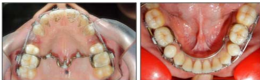
Fig. 3- Soldered transpalatal arch attached to miniscrew by closed coil spring and soldered lingual arch

infiltration anesthesia, anteroposteriorly at the level between first and second molars. A transpalatal arch was fabricated with 1mm stainless steel wire such that it stayed approximately 5mm from palatal mucosa. Three hooks were soldered to it for application of intrusive force on maxillary dentition. A lingual arch was soldered to lower first molars (Fig. 3). After 6 months of treatment, .019/.025 stainless steel working archwires could be engaged in both arches. Closed coil spring (11mm) was attached to hooks on either side and attached in the centre to palatal implant by ligature tie. The maxillary incisors were also simultaneously intruded by incorporation of curve of spee in upper archwire. This produced intrusion of entire maxillary dentition. The intrusion took approximately 12 months, after which the coil spring and hooks were removed and transpalatal arch was tied to implant by ligature tie (Fig. 4). In this way, the mandible autorotated counterclockwise upward and forward resulting in reduction in anterior facial height and slight advancement of chin. Following mandibular autorotation, anterior bite deepened and necessitated incorporation of reverse curve in lower