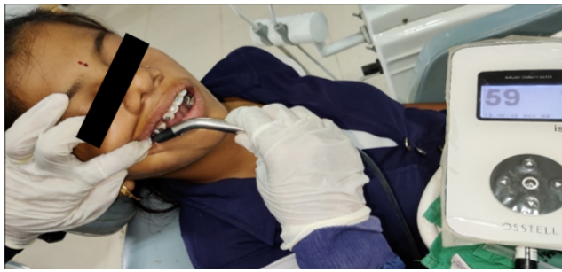
Figure 4: Reading inmesiodistal direction (D1).