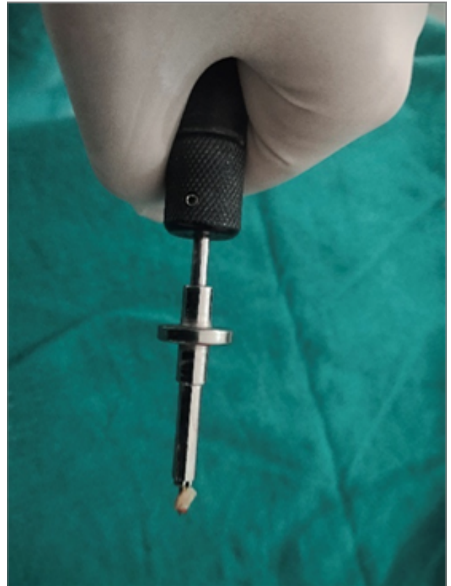
Figure 3: Micro implant coated with PRF

direction D2 i.e., Occluso-gingival direction using Mann Whitney test at T0, T1, T2, T3, T4 and T5 in both the groups. (Tables 2 and 3)