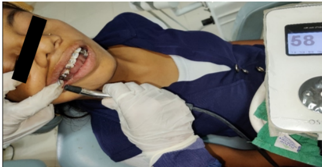
Figure 5: Reading in occlusogingival direction (D2).