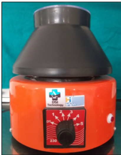
Figure 2: Centrifugal machine