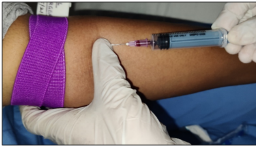
Figure 1: Blood withdrawal using 5ml syringe