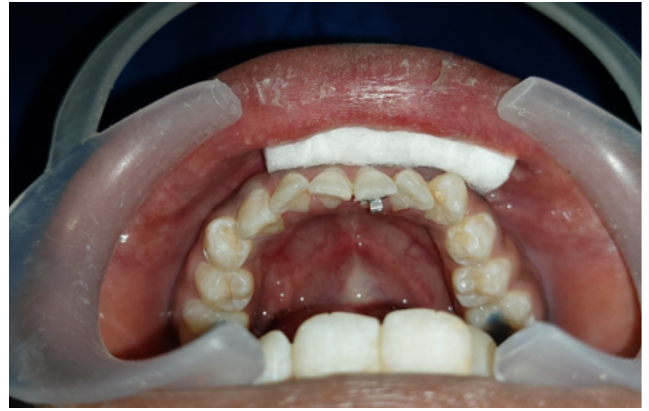
Figure 9: Bracket placed on the long axis of the tooth