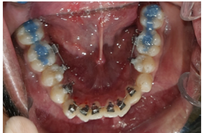
Figure 10: Entire bonding done and wire ligated