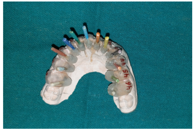
Figure 4: Cold cure acrylic resin used to make outer core of the transfer tray