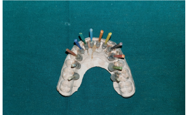
Figure 3: Soft denture reline material used to make the inner core of transfer tray