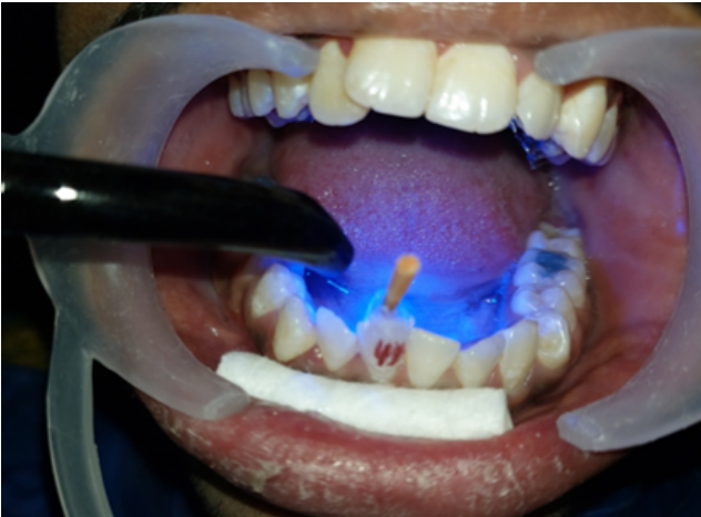
Figure 7: After sandblasting the bracket base and placement of orthodontic adhesive, bracket positioned and cured on the designated tooth with the help of new transfer tray.