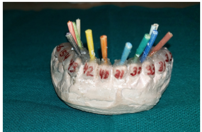
Figure 5: Transfer tray marked individually according to the tooth number.