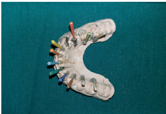
Figure 2: Undercuts blocked out with orthodontic wax and long axis markers embedded in the wax according to the long axis of the tooth.