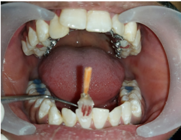
Figure 8: After bonding, transfer tray easily removed with a probe.