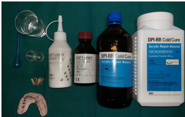
Figure 1: Armamentarium needed