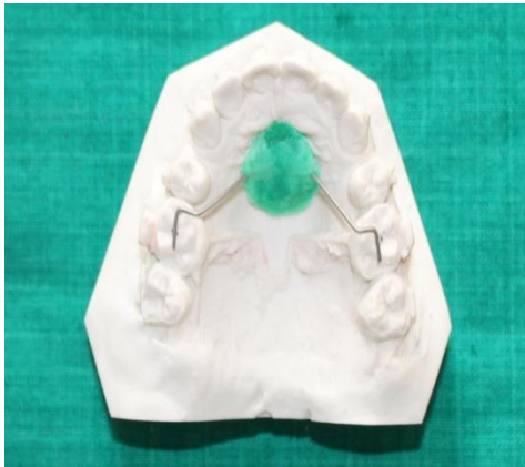
Figure B. Jig placement at mid of retraction