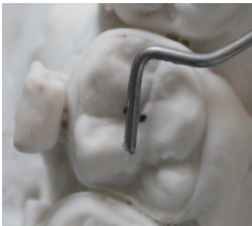
Figure C. Jig placement at occlusal surface of Molar at mid of retraction