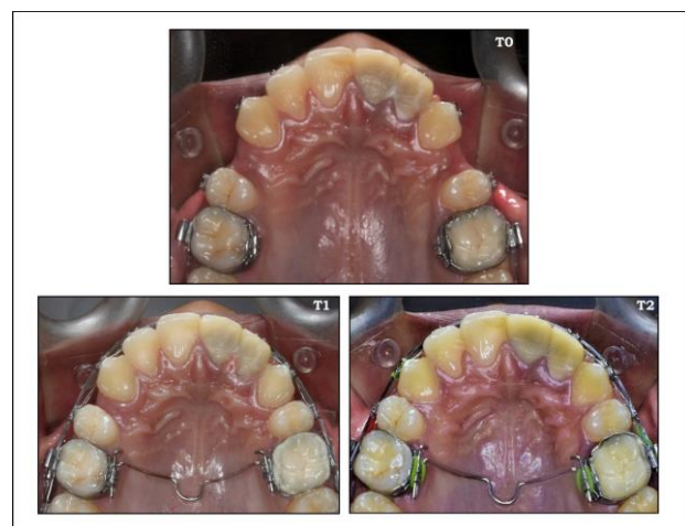
Figure 2: Beginning of enmasse retraction (T0) Completion of space closure on experimental side (T1), Completion of space closure bilaterally (T2)

Although the piezocision procedure removes less bone than the conventional corticotomy procedure, no clinical difference in bone support or periodontal health was seen between the two sides in this study. This may be explained in the manner of bone removal. The piezocision procedure done was not a true osteotomy, with a block of bone removed. The procedure only perforated the bone in few areas, leaving the original bony architecture intact. This allowed the resorption/deposition cellular process to proceed within the existing architecture. Gingival recession, bone dehiscence, and increase in root resorption were not observed in either experimental and control side. The risk of remaining scars might limit the indications for piezocision in high lip line patients. The patient centered acceptance was satisfactory with this technique, thus considering piezocision as a new promising therapeutic tool for orthodontic treatment.