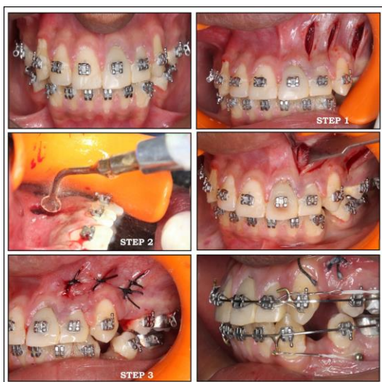
Figure 1: Showing standardization of MBT appliance,

In the present study, 10 subjects were selected according to the inclusion criteria. Split-mouth technique was used in all subjects wherein the upper left quadrant was designated as the experimental side and the upper right quadrant was designated as the control side. Before commencement of study the patients were advised good oral hygiene methods and also were systematically checked for periodontal problems if any and were given an oral prophylaxis one week prior to study. Piezocision was done on the upper left side and retraction was started on the right and left side simultaneously with conventional active tie backs. At the end of enmasse retraction on experimental side assessment of weeks taken for space closure was noted along with the assessment of space left out in control side. Measurements were noted on both control and experimental side using digital vernier caliper [figure 4]. Impressions and study models were made at baseline and after enmasse space closure on experimental side to assess the rate of retraction. The velocity of tooth movement in both scenario were calculated with assessment of time taken for experimental and control side complete space closure.