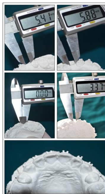
Figure 4: Space closure in experimental and control sides at T0, T1 and T2

Rate of retraction was evaluated by measuring distance from mesial most point on second premolar to the distal most point of canine using Digital Vernier Calipers. Piezocision side showed rapid enmasse retraction compared to control side.