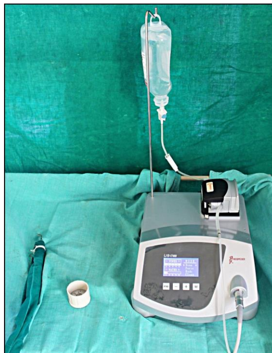
Figure 3: Piezotome unit

side using digital vernier caliper. Impressions and study models were made at baseline and after enmasse space closure on experimental side to assess the rate of retraction.