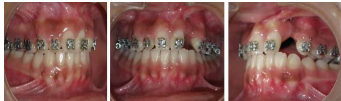
Figure 5: Intraoral Photographs after maxillary arch Expansion