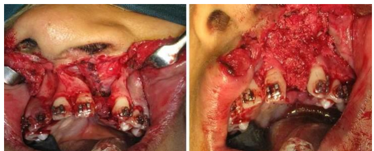
Figure 8: Secondary Bone Grafting into the Cleft Site

The lower arch was strapped up three months post-surgically for levelling and aligning. The arch expansion was maintained using 0.9mm stainless steel wire.