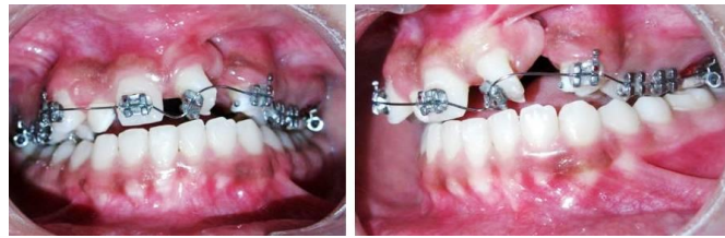
Figure 4: Bonding with 0.022x0.028” Metal MBT™ versatile plus Brackets