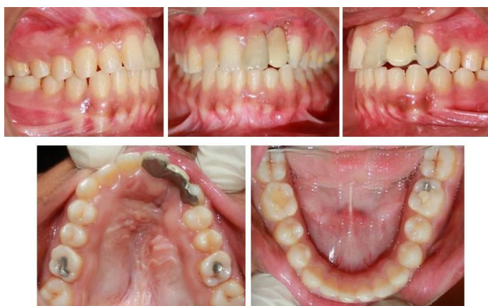
Figure 9: Posttreatment Intraoral Photographs

The facial photographs after the bone grafting and lip revision showed a commendable change in the nasal and lip deformity. (fig. 10)