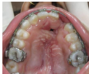
Figure 6: Occlusal Photographs after maxillary arch Expansion

Post expansion the patient underwent a secondary bone grafting in the cleft region using iliac crest graft (fig. 7 and 8). Simultaneous lip revision with columelloplasty was done to correct the nasal deformity.