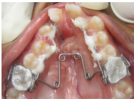
Figure 3: Maxillary arch expansion using Quad Helix

With regular activation of Quad helix upper arch was overcorrected till the palatal cusps of upper buccal teeth occlude with the lower buccal cusps. (fig. 5 and 6)