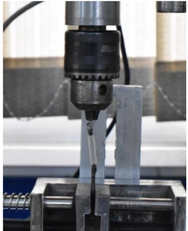
Figure 1: Testing of the elastics in universal testing machine

Group with 6Oz force and 3/16" lumen showed 12.5% force loss at 24 hours and 17.8% at 48 hours and 18% force loss at 24 hours and 24.1% at 48 hours at maximum extension. The results of subgroup 6Oz – 3/16" and 3.5Oz – 3/16" are similar to the results of a study by Kersey et al. 3 Their study also indicated that dynamic testing led to faster