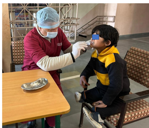
Figure 3: Clinical examination of subject with physical disability (Group II)