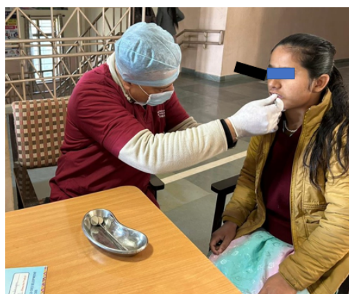
Figure 5: Clinical examination of subject with visual impairment (Group IV)

Further-more according to DHC grades of index of treatment need in various groups among males and females malocclusion was found more in subjects with mental retardation as compared to other groups and there were no statistically significant differences in DHC grades between gender as shown in Table 9. The prevalence of the malocclusion was found to be more in the subjects with the mental retardation and physical disability followed by hearing and visual impairment according to overall DHC grades of index of treatment need in various groups using chi-square test in district Mandi, Himachal Pradesh and there were no statistically significant differences between groups as shown in Table 9.