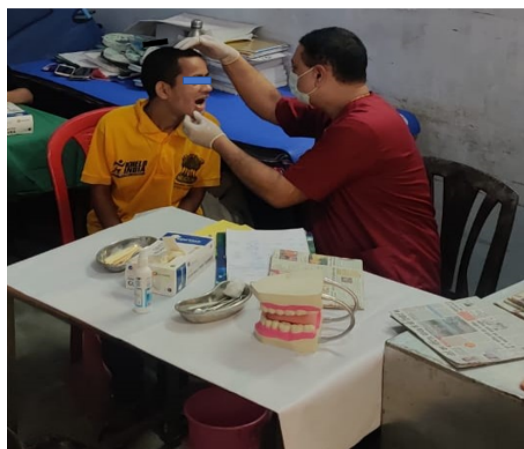
Figure 2: Clinical examination of subject with mental retardation (Group I)