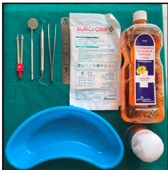
Figure 1: Armamentarium used for clinical examination in the study