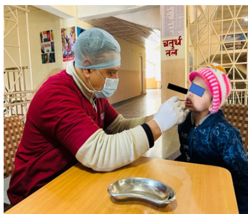
Figure 4: Clinical examination of subject with hearing impairment (Group III)